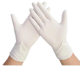
SURGICAL HAND GLOVE