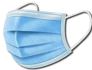
3 PLY DISPOSABLE MASK