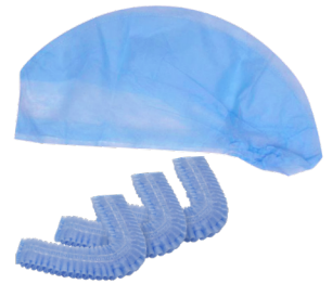
SURGICAL HEAD COVER